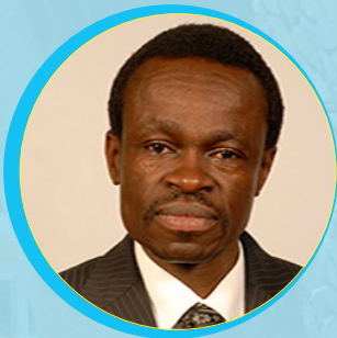
Prof. P.L.O. Lumumba Secretary